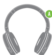
A. Wireless Headphones